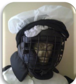
SPIT HOOD – Fits over any additional Protective helmet which is worn