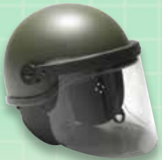
Olive Drab Green