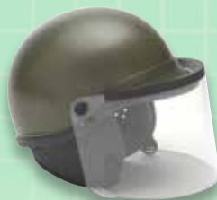
Olive Drab Green