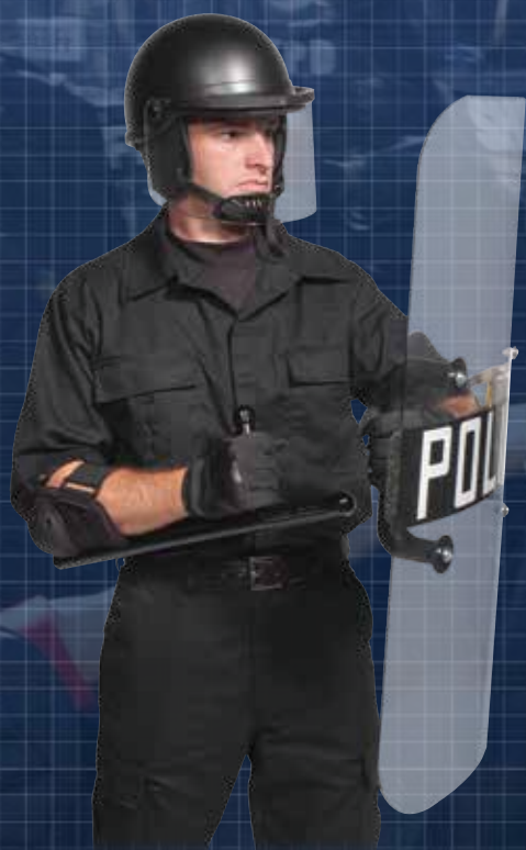
Premier Crown Body Shields