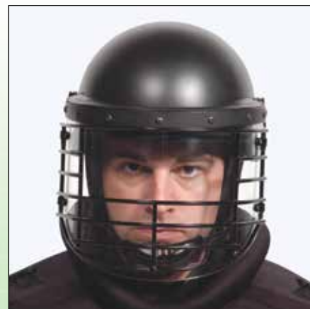
Front view of Model 900LTC.