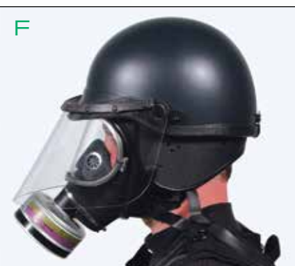
Model 906FS6 pictured showing gas mask clearance.