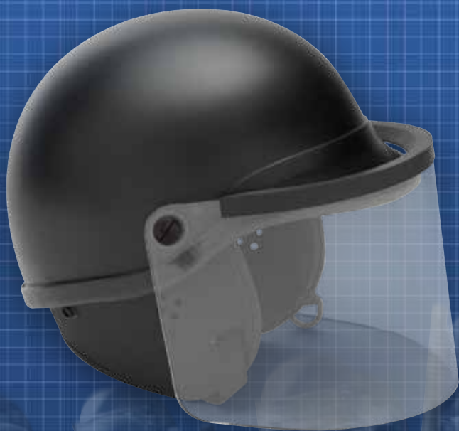
Premier Crown Tactical & General Duty Helmets