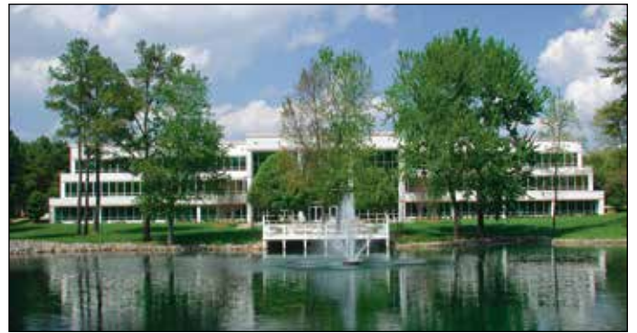
SIRCHIE Headquarters in Youngsville, North Carolina