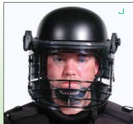
Front view of Model JCR100C.