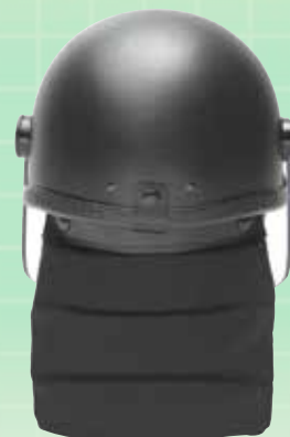
Rear view of Model 900LT with nape pad.