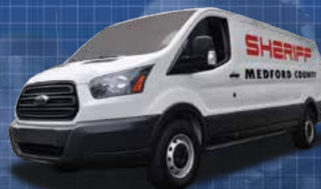
Specialized Police Vehicles