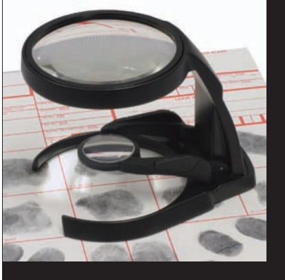
7X With Second Lens In Place

The 2.5" (65 mm.) diameter and the 1" (25 mm.) diameter lenses are optically ground and polished glass, providing uniform magnification, brightness, contrast, and color without significant geometric distortion.