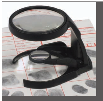
7X With Second Lens In Place

The 2.5" (65 mm.) diameter and the 1" (25 mm.) diameter lenses are optically ground and polished glass, providing uniform magnification, brightness, contrast, and color without significant geometric distortion.