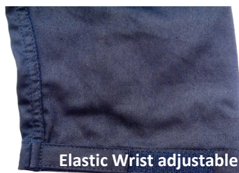
Elastic Wrist adjustable