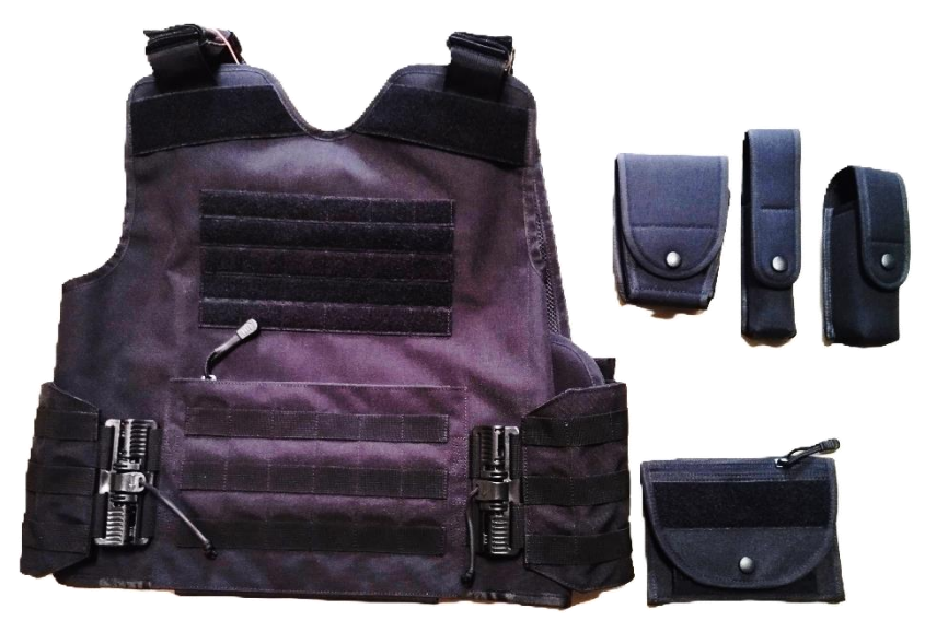
Demo with Baton, OC, Handcuff and Universal Pouches